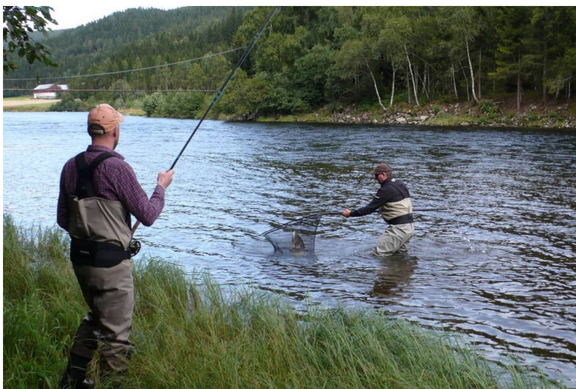
Netting a 22 pound hen salmon in Aunhølen (Home Pool) at Aunan. From season 2011.