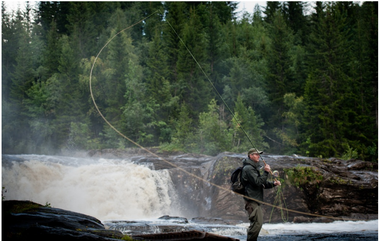
Casting in Fossen, Forra.