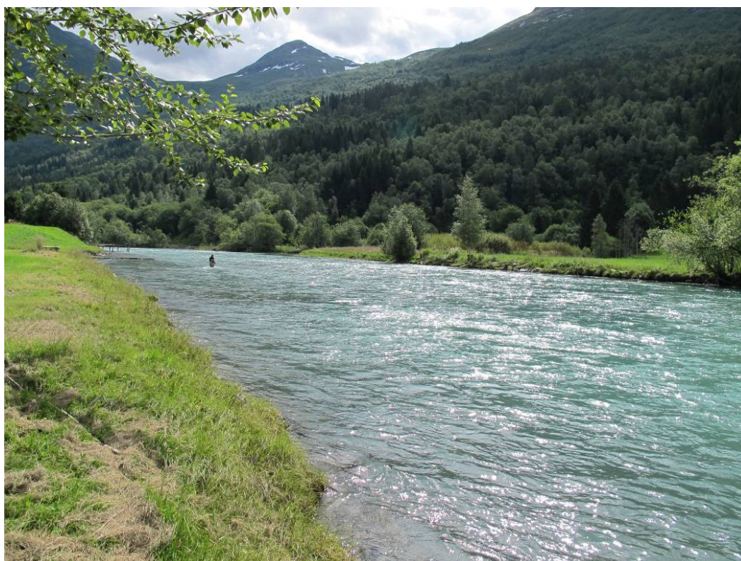
View of river Stryn.