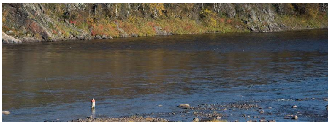
Fishing in Ponoi River.